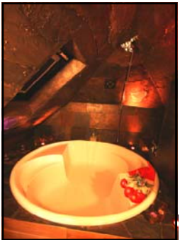
Morpheus Cavern Bathroom and Luxury Lounge