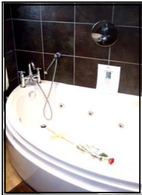
Aphrodite Spa Bath