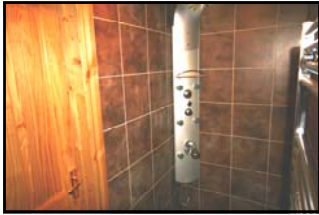
The Hesperus Wet Room/ Shower

Birthdays Anniversaries Your Wedding Night Engagements Love & Romance